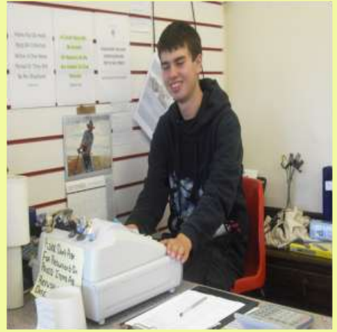
Manning the till!

Students from Post-16 are running the PEOPLE Charity Shop in Westfield every Tuesday morning. With the support of a member of Fosse Way Post-16 staff the students are taking delivery of donations, sorting, pricing and displaying them. They are operating