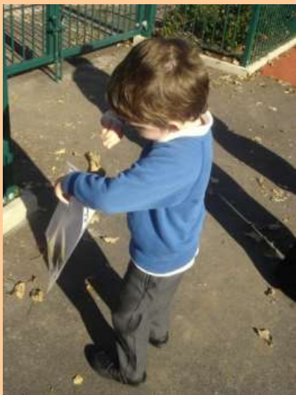
A diligent leaf collector!

In ASD Foundation we have been looking for signs of autumn.