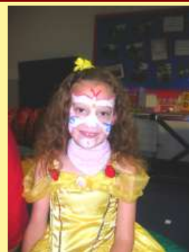
Dressing up and make-up—always fun!

Everyone had great fun at the Summer Play scheme this year. Activities ranged from arts & crafts, swimming/canoeing, face painting, cycling, cooking and much much more.