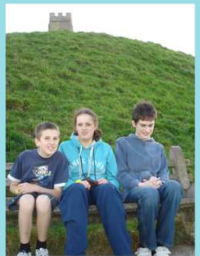
A well earned rest during a walk to Glastonbury

We have made the most of the fine evenings this term, with lots of walks and outdoor activities.