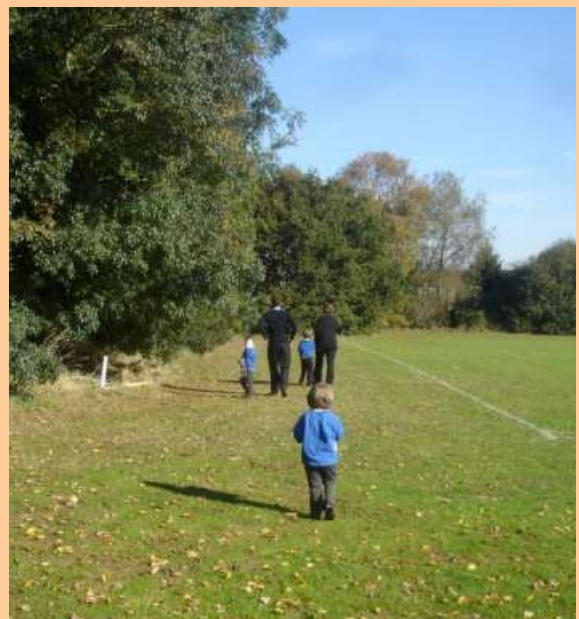
On the autumn walk!

We went on a walk to look for different coloured leaves, then brought them back to the classroom and made some lovely collages with them. We have learned about how trees drop their leaves and we will be following the seasons.