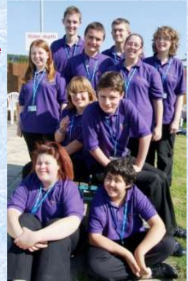
The Project Search group!