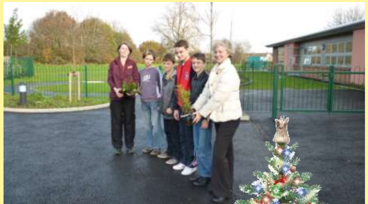
Being presented with the free trees!