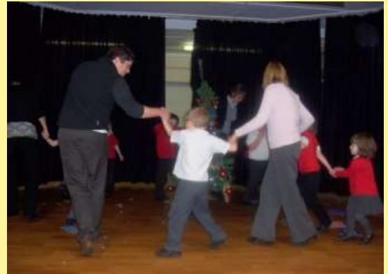
KS1 Rocking around the Christmas Tree!