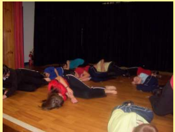
It's hard working rehearsing! (Even if it is part of the dance!)