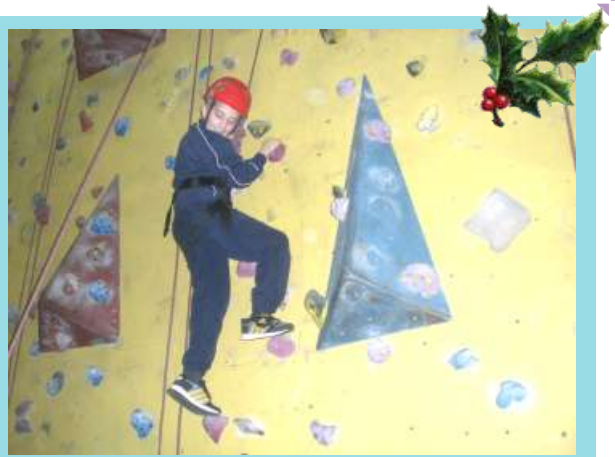
Reaching new heights!

And in more regular activities, some of our pupils joined in GCSE PE group Trampolining at Norton Hill, demonstrating the acrobatics possible with support!