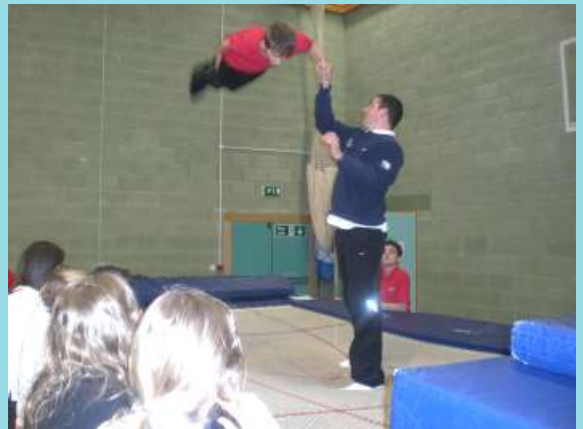
Up up and away!