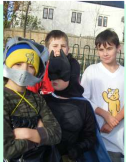
Dressed up for charity!