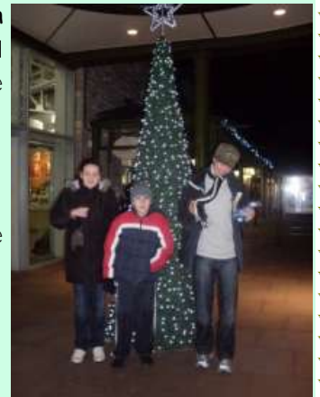
Out Xmas Shopping!